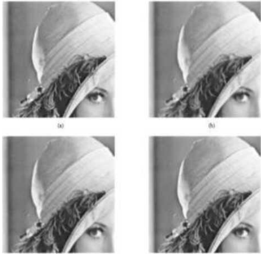
Fig2:a)Original low resolution boolean image. b)Bicubic interpolated image.c)Super resolved image using WZP.d)Proposed technique.