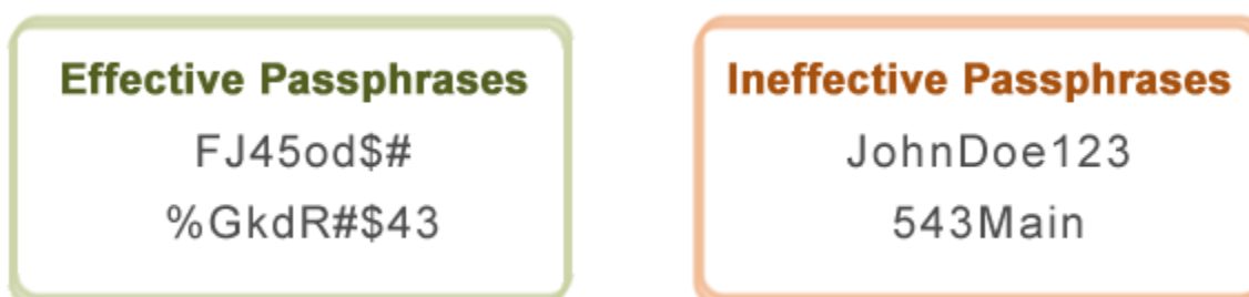
Fig.1 Sample Password

This will prevent others from accessing the router and you can easily maintain the security settings that you want. You can change the password from the Administration settings on your router's settings page. The default values are generally admin / password.