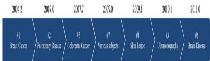
Fig. 3. CAD development history.

After examining the educational environment of CAD research, we selected the four best radio frequency quarterlies in each cluster[34]. The outcomes showed us the specific characteristics of the main journals frequently cited in each cluster (e.g., companies that manufacture photo-optical devices, medical physics, etc.)[35]. For example, there is no cluster. Computer magazines were preferred in 6 (e.g. lecture notes, applications). This may indicate that CAD needs progressive calculation methods for image processing in brain diseases[36]