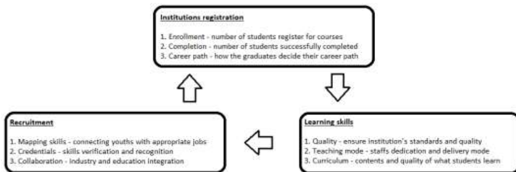
Figure 1. Blueprint for exploring the education to employment system.

& Barton [11] argued that if young people graduating from schools and universities, after exerting lots of efforts, cannot secure decent jobs and observe that sense of respect that comes with such degrees, society may witness outbreaks of anger or even violence. There is an information gap in what works and what does not in preparing young people during their school to employment transition. We summarized this information gap and it clearly shows there is a clear disconnect and misperception about youth job readiness from the point of view of employers vs youth vs educational institutions.