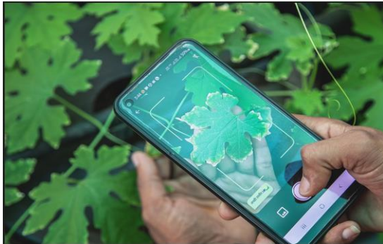
Fig. 3 : Identifying Pests (Source https://india.mongabay.com )

algorithms analyse patterns in pest behaviour and environmental factors, allowing for timely intervention with targeted pest control measures, reducing damage and pesticide use. Following fig.3 shows one example of identifying pests.