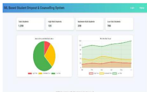
Figure 1 : Showing ML Support System