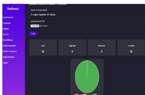
Figure 2 : Showing % of Drop out Prediction

The results show that the system can effectively classify students into risk categories and provide actionable insights.