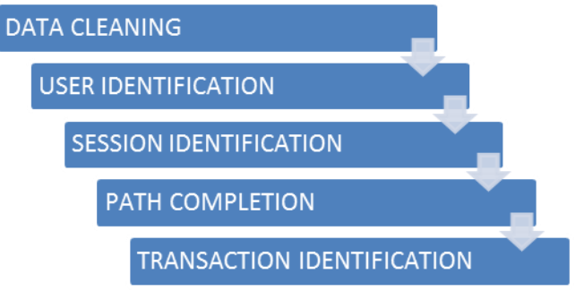
Figure 2 Steps for data Pre-Fetching

So the string that will be left to us after cleaning will be www.facebook.com. After the cleaning of the data whatever the data is required by the user will be displayed on the basis of the apriori algorithm. In this algorithm we will assume the confidence level nearly 60% and the term that appears less than 60% will be removed and the more combination is applied to take the proper frequent set of the given data.