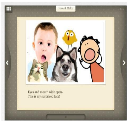
FIG 3: VIEW OF KID IN STORY

Autistic children would sometimes show disruptive behavior and gets aggressive very quickly. It seems to be very difficult to handle them in such a situation. A need for some technology arises where parents could divert child's attention and also teach them about the aggressive behavior which could not be appreciated. To make them focused to a particular technology is a challenging issue that need to be addressed. Kid In Story is an app which helps to create stories where the child himself would be projected as the main character. Voice can be used to narrate the story. This will make them understand their own behavior in a better way. This app has many built in templates which make them do their daily routines, organize study material, create their own stories also.