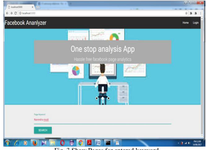
Fig. 3 Show Pages for entered keyword.

Eg: Go to browser and enter the url as: localhost 5000. Keyword entered is: Narendra Modi