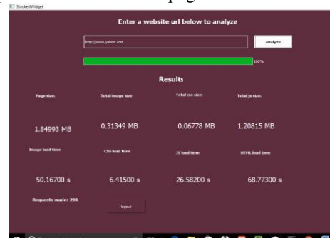
Page Size: 1.84 MB

Once the user enters his/her user credentials ,he/she registers then he/she can login, once the user logins he/she has to enter an URL on which automation testing has to be done starting with http:// and once the URL is entered and the response time of the web page content is displayed. Figure 3 shows the size and response time of the web page