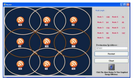
Data sending for each node

The average energy consumption per node, and energy good puts for the five different schemes mentioned above with varying packet injection rate (0.2-2.5 packets/second). In the high packet injection rate, both 802.11 and ODPM show a higher PDR than 802.11 PSM, RCAST, and RandomCast because all (802.11) or more (ODPM) nodes are in AM and participate in the packet transmission. On the other hand, 802.11 and ODPM consume more energy than RCAST and RandomCast. It is important to note the performance difference between RCAST and RandomCast. RandomCast achieves a higher PDR, particularly when packet rate is high. In the graph it is clear that after certain extent the overhead increases exponentially with increase in number of nodes.