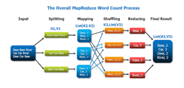
Figure 2 illustrates the pattern on big data processing based on the MapReduce framework.

computing. At the same time, such processing mode based on paralleling is applicable to the enterprise distributed system and can be used to hundreds of servers. These parallel processing machines and their computing of services conceal the realization details to users and are transparent for users, as a result of which big data processing can be realized by using MapReduce modules through SQL scripting sentence[3]. The interface function of such MapReduce can normally operate under the database system circumstance, and its returned result sets remain a usable data table.